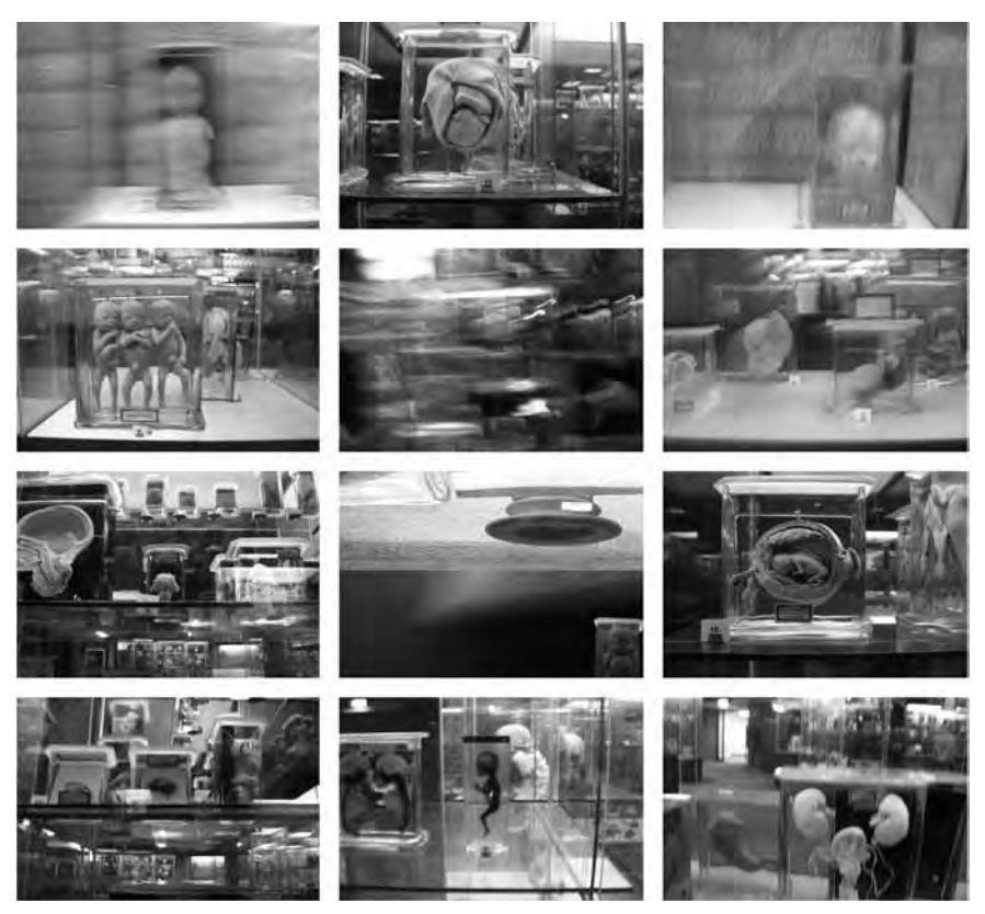
Figure 1: Suzanne Anker Water Babies , 2004. Digital prints.