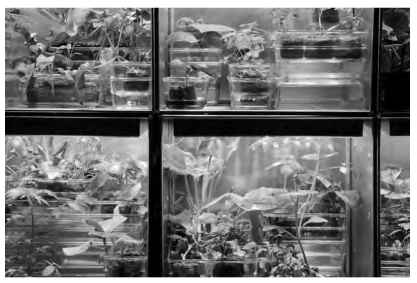
Figure 2: Suzanne Anker Astroculture (Eternal Return) , 2015. Vegetable producing plants grown from seed using LED lights. Galvanized steel cubes, plastic, red and blue LED lights, plants, water, soil and no pesticides. 42 x 14 x 14 in (106.65 x 35.65 x 35.65 cm) each set. Installation view at The Value of Food , 2015 The Cathedral Church of Saint John the Divine, NYC.