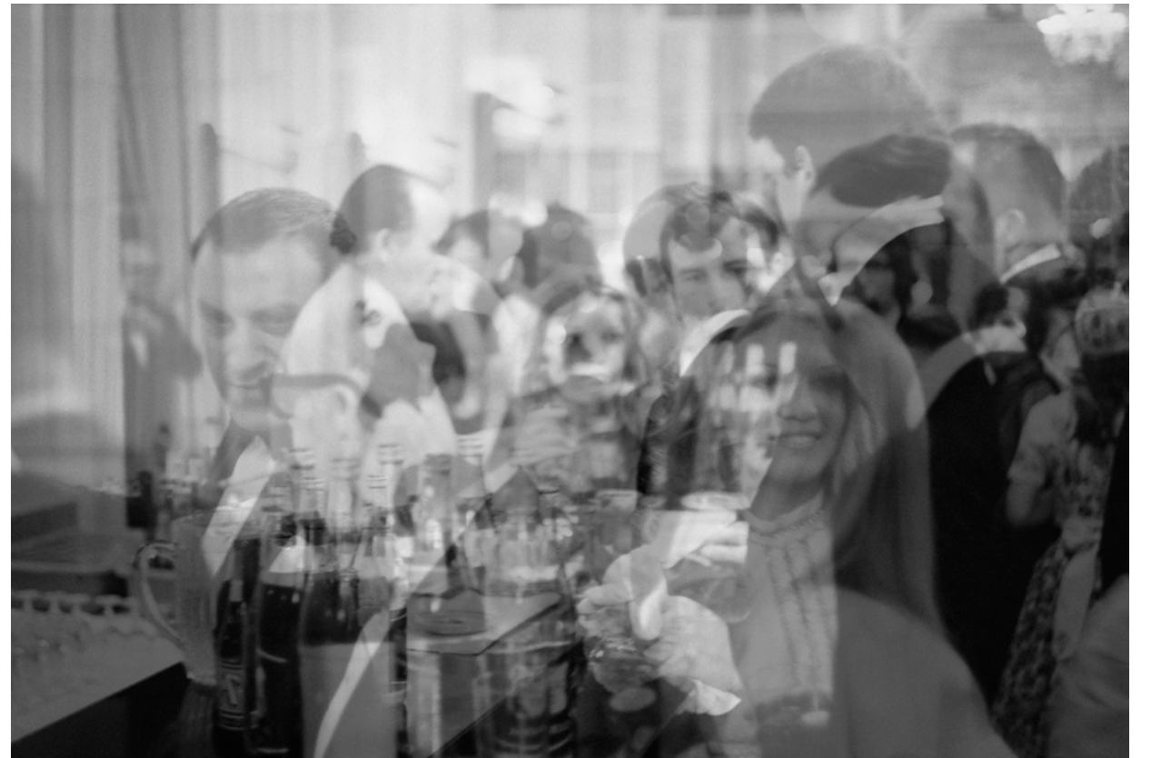
Magnetic (Simulation of lenticular image interlacing the three images on the left)