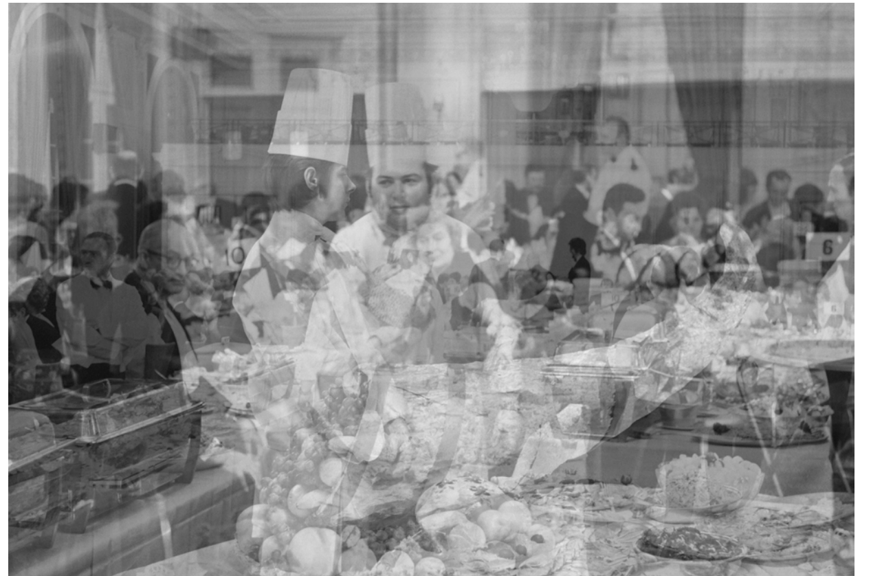
Cornucopia (Simulation of lenticular image interlacing the three images on the left)