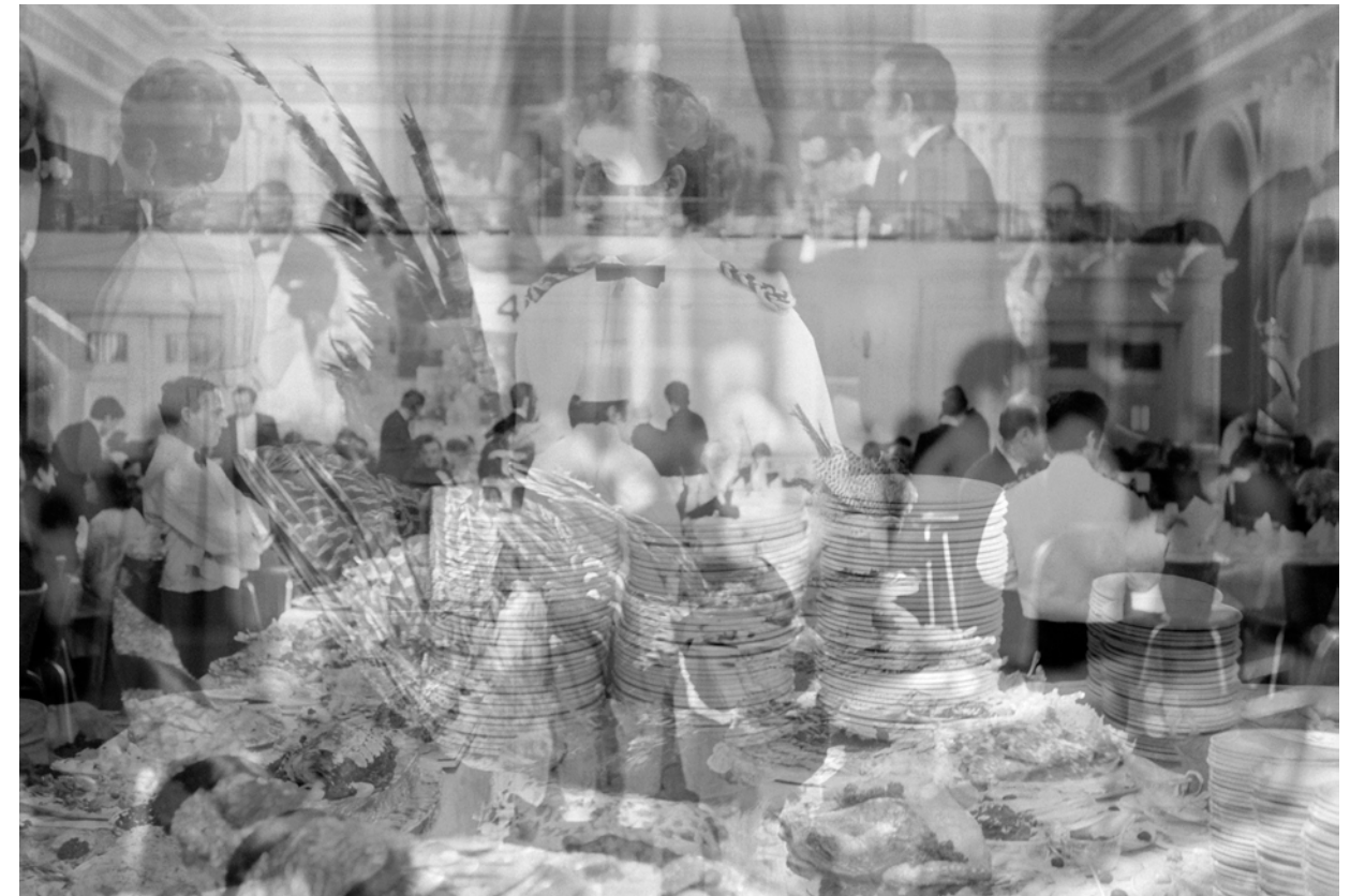
Display (Simulation of lenticular image interlacing the three images on the left)