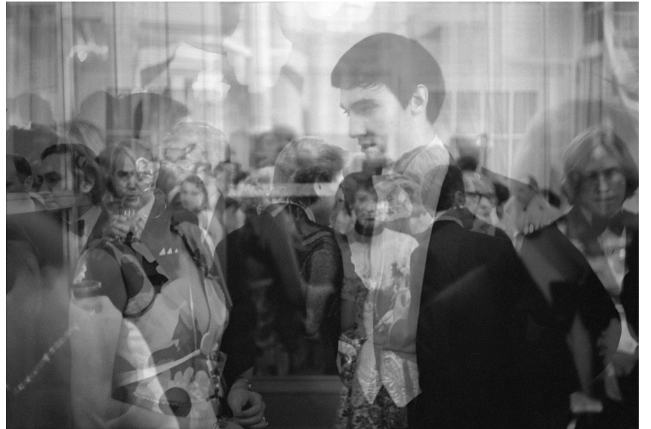
In Conversation (Simulation of lenticular image interlacing the three images on the left)