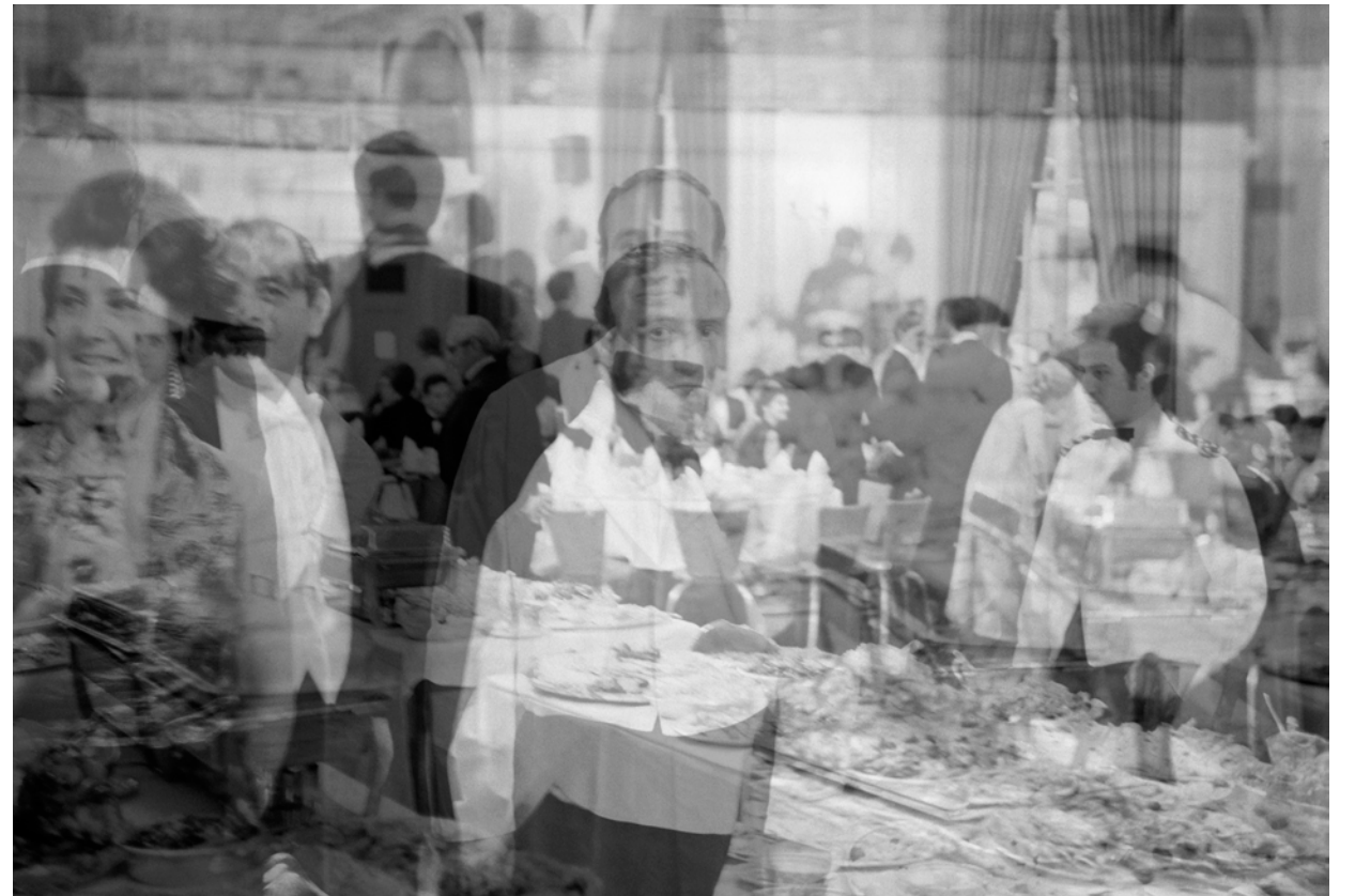
In-Between Moments (Simulation of lenticular image interlacing the three images on the left)