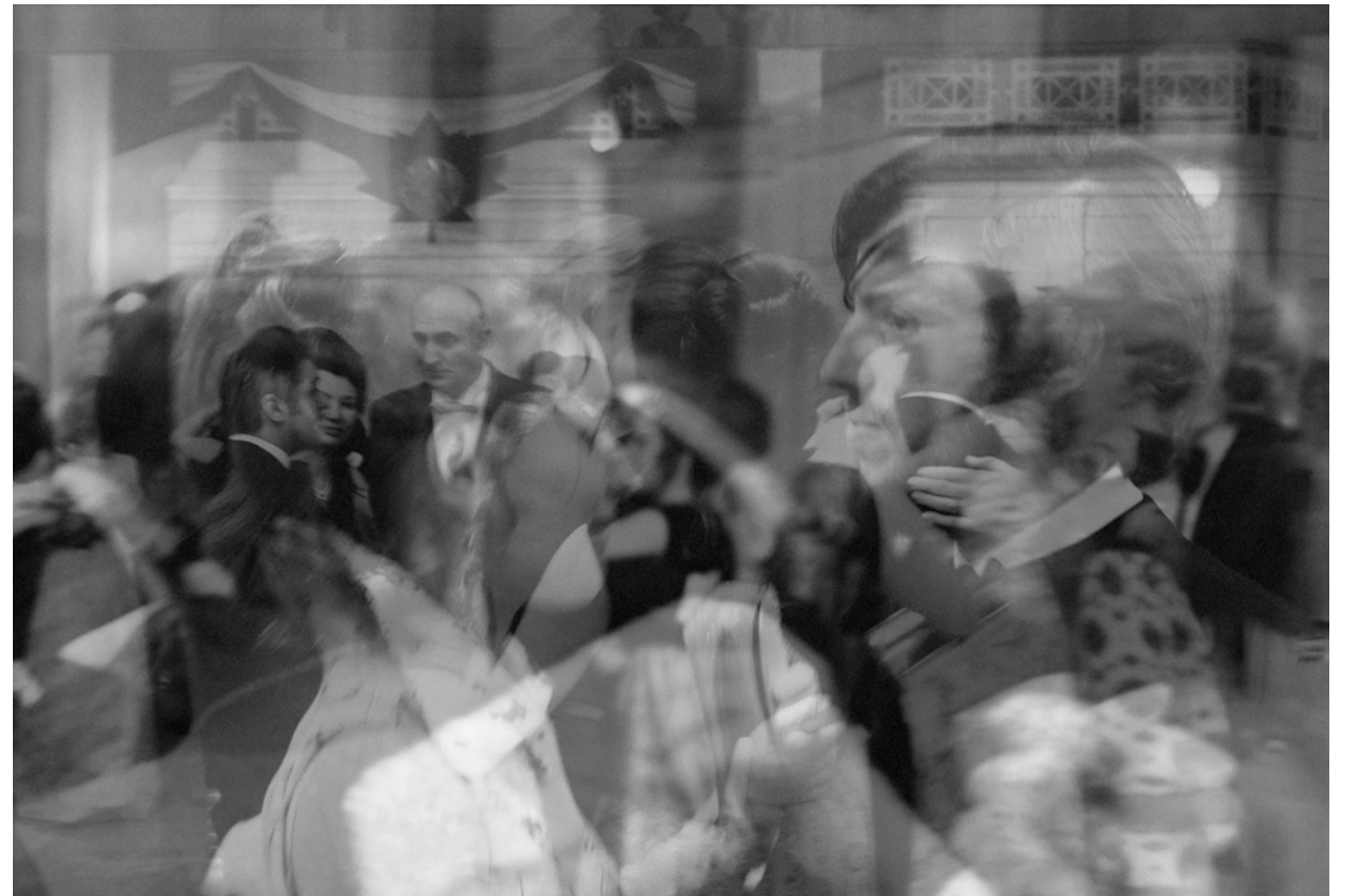
Movement (Simulation of lenticular image interlacing the three images on the left)