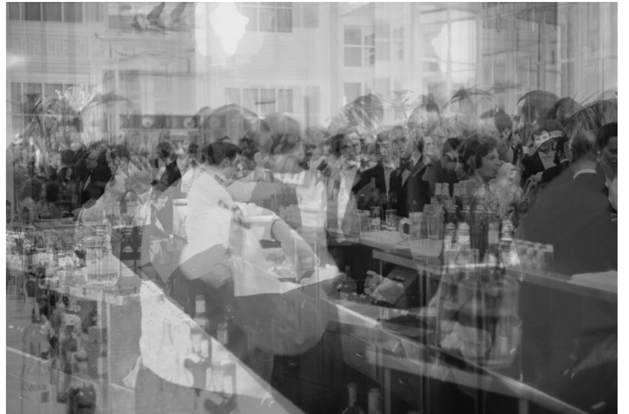
At the Bar (Simulation of lenticular image interlacing the three images on the left)