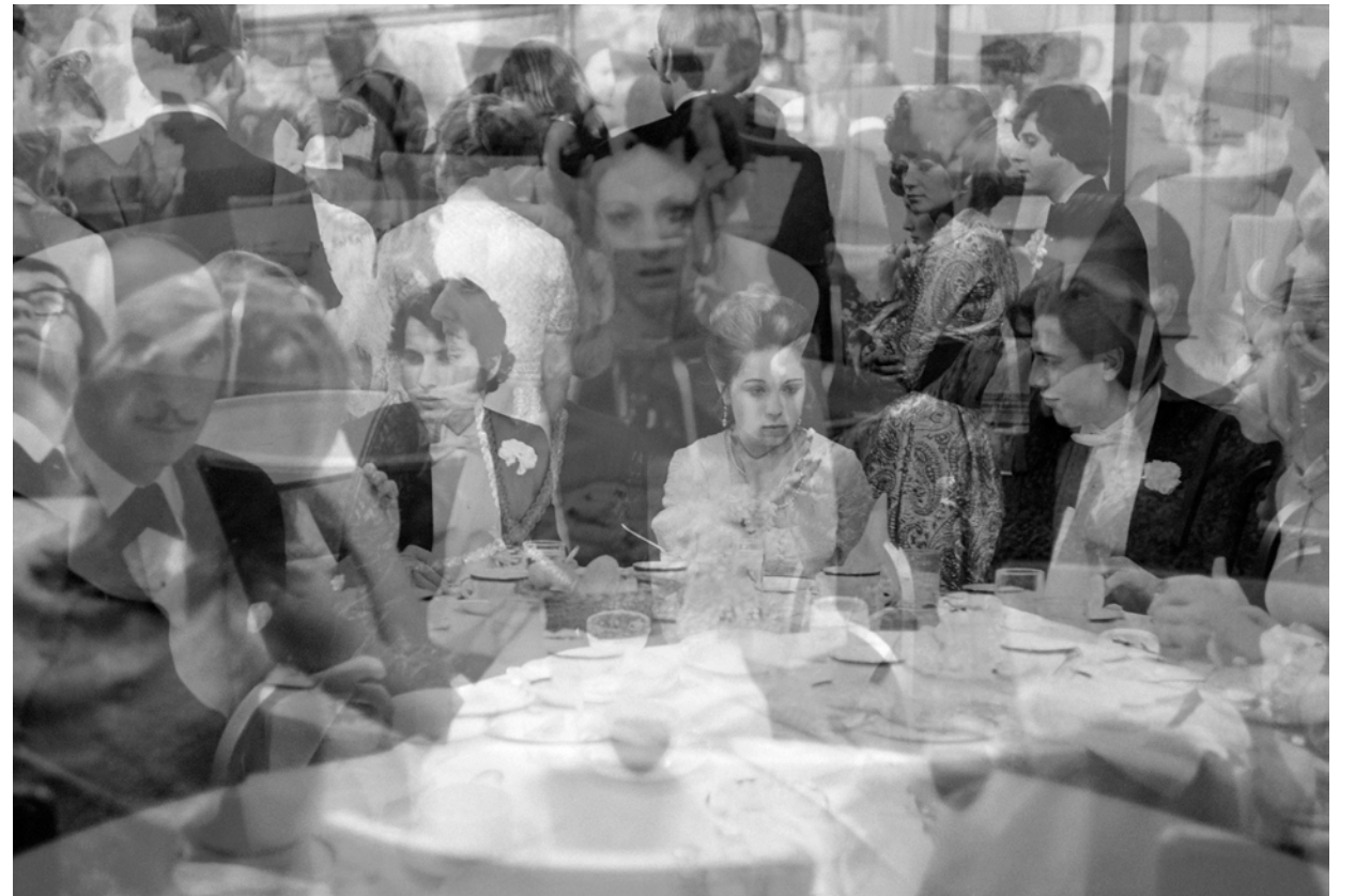
At the Table (Simulation of lenticular image interlacing the three images on the left)