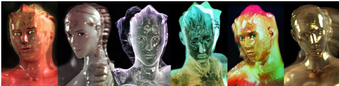
Figure 1: Lin Pey-Chwen, Portrait of Eve Clone , holographic printing, 2010. © Lin Pey-Chwen

This article discusses Lin Pey-Chwen's new-media artwork Portrait of Eve Clone , one of the pivotal presentations in Dancing with Time - Artists: 40 Years × Taiwan Contemporary Arts . The exhibition, co-organized by Kaohsiung Museum of Fine Arts and Artist Magazine in 2015 and based on Taiwan Contemporary Art Historiography: Artist Magazine 40 Year Anniversary Edition (published in the same year), presents the development of contemporary art in Taiwan over four decades. Listed as a pivotal artwork of 2011 in the art historiography and exhibited in one of the four main exhibition areas named "Trans-disciplinary and Unconfined (2005-2014)", Lin's work clearly occupies an important niche in Taiwan's art history. However, as far as the author knows, no in-depth and comprehensive analysis of each element in the work has been conducted so far. Therefore, this article attempts to take a closer "look" at her piece of work from this angle.