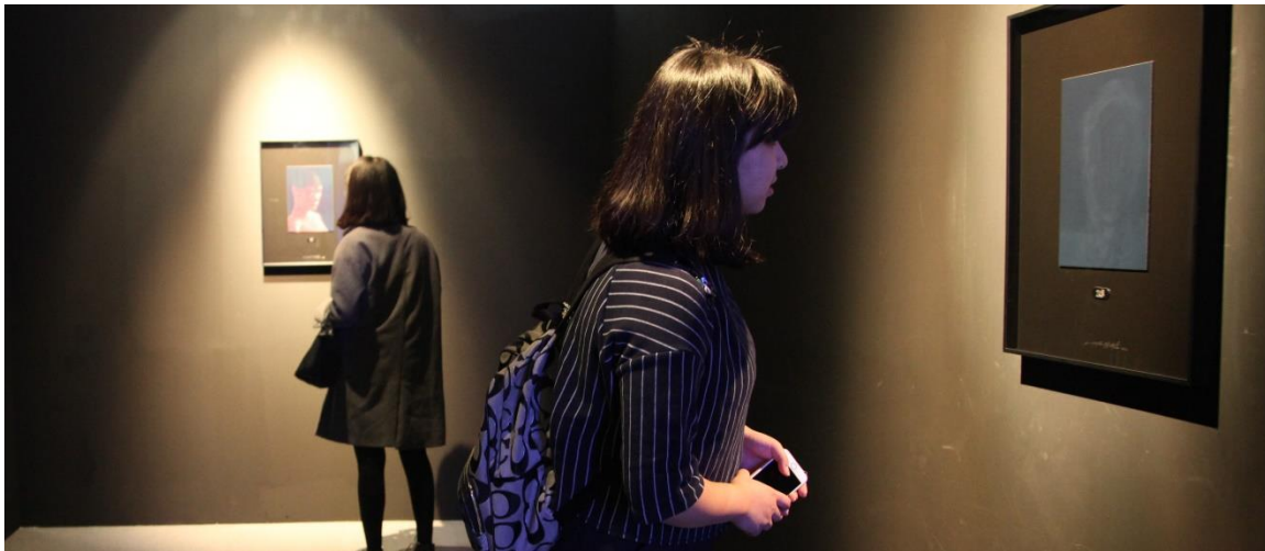
Figure 2: Portrait of Eve Clone at Digital Attraction , FZ15 Animation & Story Callary, 20115-16. © Lin Pey-Chwen