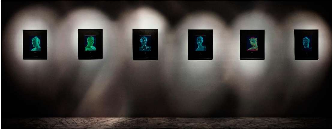
Figure 3: Portrait of Eve Clone , Taipei Fine Arts Museum, 2015. ©LI Jing-wei