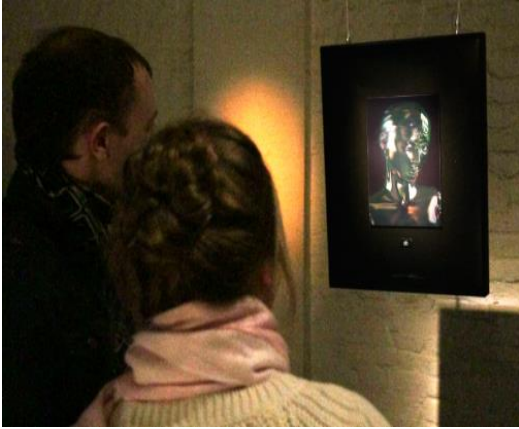
Figure 5: Portrait of Eve Clone , International Festival of Electronic Art 404, Platforma , Moscow, 2014. ©Kuo Wei-peng

subjective act. In contrast, being stared at by a stranger is downright uncomfortable. As I looked closely at Lin's work, this kind of unease set in again. Holographic printing is dependent upon changes to spectators' viewing angles. By skillfully utilizing this property, the artist makes the figures in the work "follow" the spectators, thereby successfully creating an unspeakable uneasiness.