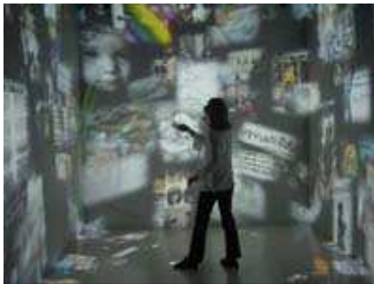
Fig. 5 Christa Sommerer / Laurent Mignonneau: The Living Web, 2002.

competence, which goes beyond mere technical skills, is difficult to acquire if the area of historic media experience is excluded. Media exert a general influence on forms of perceiving space, objects, and time and they are tied inextricably to humankind's evolution of sense faculties. For how people see and what they see are not simple physiological questions; they are complex cultural processes, which are influenced by many and various social and media-technological innovations. These processes have developed specific characteristics within different cultures and it is possible to decipher these step by step in the legacy left by historical media and literature concerned with visualization, including from the fields of medicine and optics. Not least, in this way light can be shed on the genesis of new media, which are frequently encountered for the first time in works of art as utopian or visionary models.