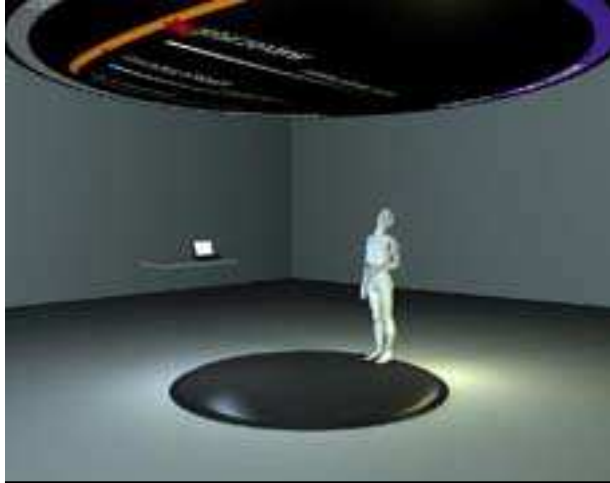
Fig. 3 Daniela Plewe: Ultima Ratio, 1997.

But without exception, neither these artworks, nor the last decades of digital art in general have received the appropriate attention by the academic disciplines or have been added in adequate numbers to the collections of museums and galleries. We are thus in danger of erasing a significant portion of the cultural memory of our recent history.