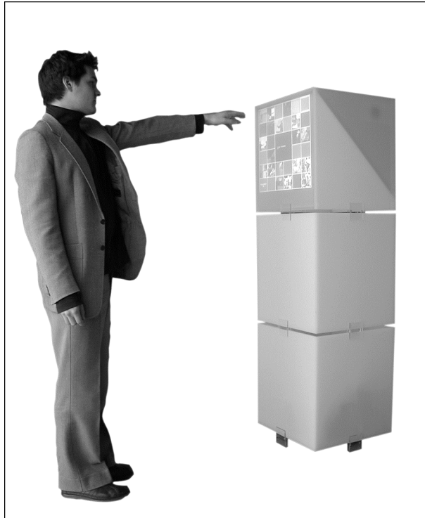
Figure 1: Information Jukebox

In this sense the Jukebox was conceived and designed as a semi-public device that gives easy and fast access to existing media files showing previous work of the MARS-Lab (see Figure 1).