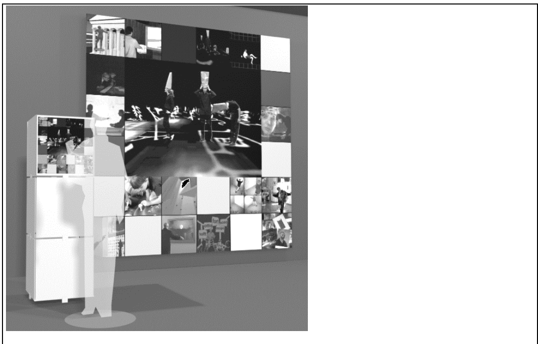
Figure 4: Possible setup with large public screen.

The setup of the installation in São Paulo also implied a large projection besides the Jukebox itself. This public display mirrored the display of the jukebox and thus enabled a broader audience to view the installation (see Figure 4).